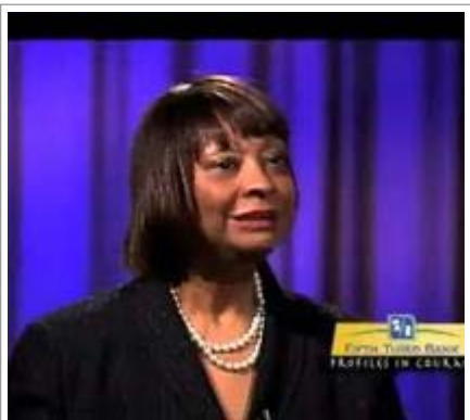
Profiles In Courage 2010