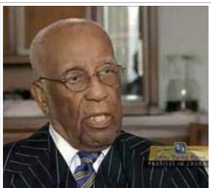
Profiles In Courage 2010