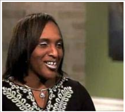
Profiles In Courage 2010