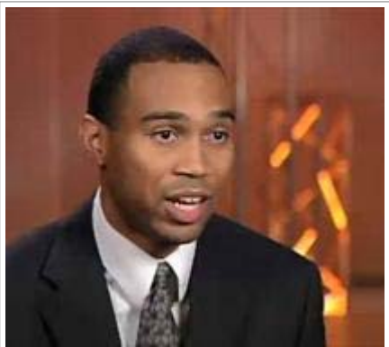
Profiles In Courage 2010 (WCPO)